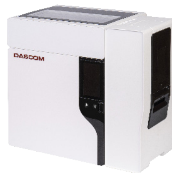
Double Bin model

DASCOCM GB Ltd Hart House, Priestley Road Basingstoke | Hampshire RG24 9PU | ENGLAND Tel.: +44 1256 355 130 | Fax: +44 1256 481 400 info.gb@dascom-com | www.dascom.co.uk